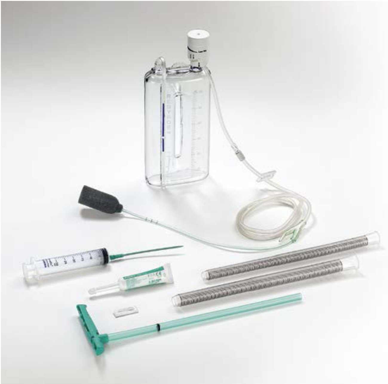
Figure 1: Endo-SPONGE treatment