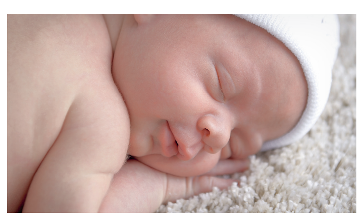
Also for your younger patients