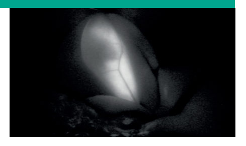
The monochromatic mode provides the greatest possible image contrast by displaying the white FI signal on a black background.