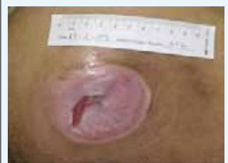
Fig 2: Improvement in the wound after seven months