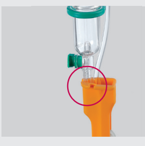
Practical spike cover for safe protection of piercing spike.