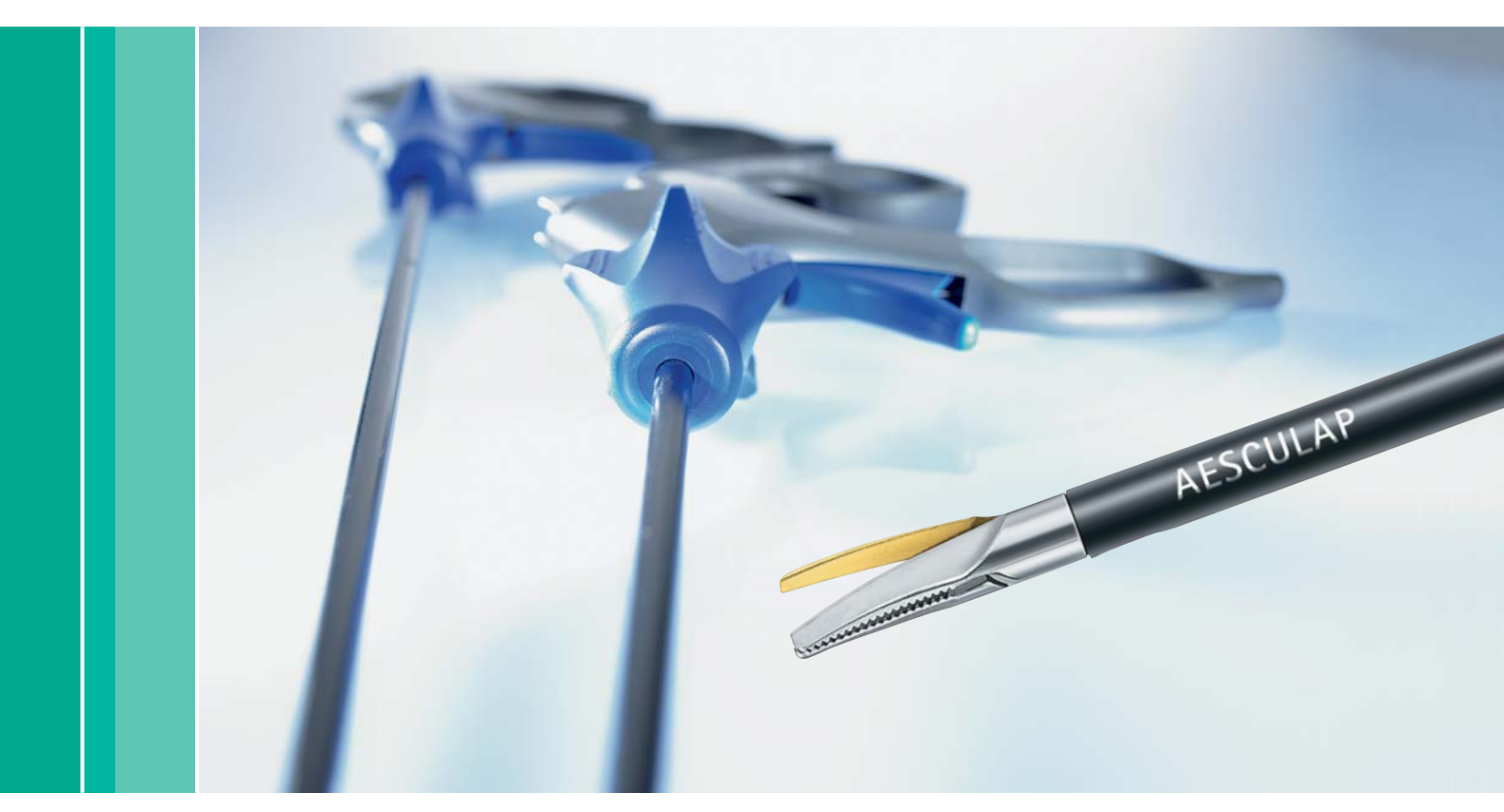
Aesculap Endoscopic Technology

Bipolar combination instrument for laparoscopy 4 in One... grasping – dissecting – coagulating – cutting.