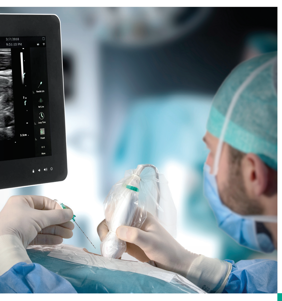
EZCOVER® - PROBE COVER SET